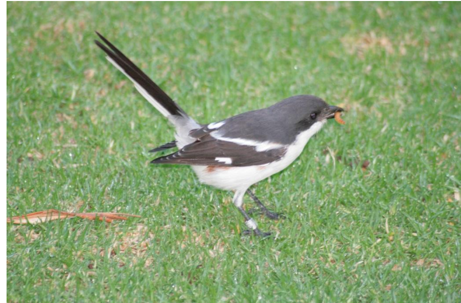
Figure 2. Ringed Common Fiscal (Ring no: 4H44298) recaptured on 22 April 2011 in Fleurdal garden and resighted several times feeding on meal worms.