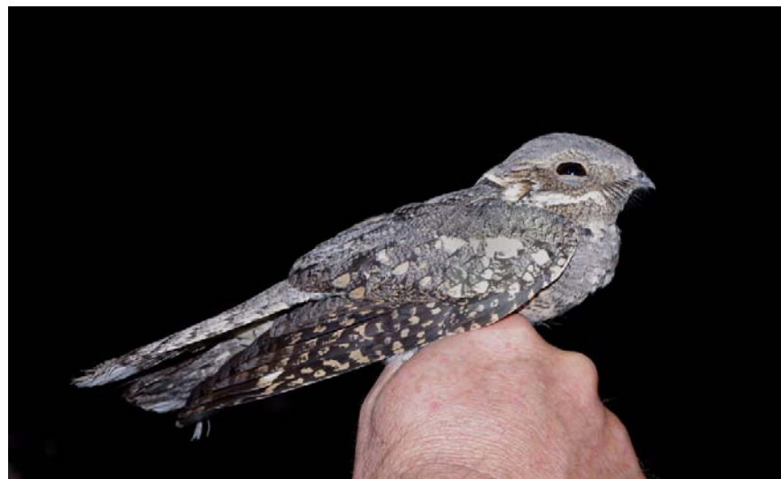
A European Nightjar – a lifer for many on the course

A total of 64 birds and 26 species were ringed in two days of ringing during the course (Table 1). The numerical winners of the ringing demonstration were a tie of nine each between Jameson's Firefinches and Emerald-spotted Wood-doves. Some of the highlights included Red-faced Cisticola, European Nightjar, several African Paradise Flycatchers and an Olive-tree Warbler. The "catch-of-the-day" was a toss-up between the European Nightjar and an Olive-tree Warbler. In the end, the latter was unanimously voted as the winner as it was a lifer for most of the guides and it was a special opportunity to see such a master "skulker" from close-up.