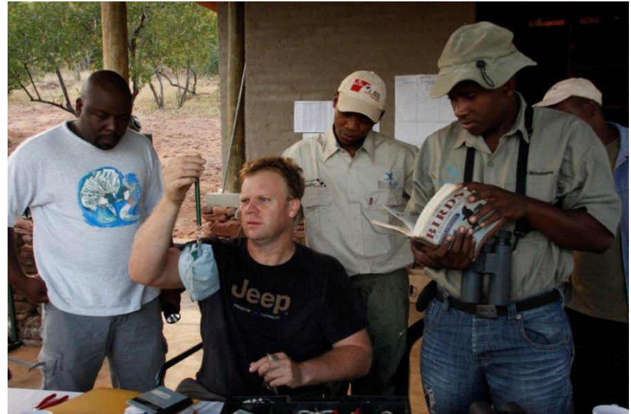
Demonstrating the data capturing side of bird ringing