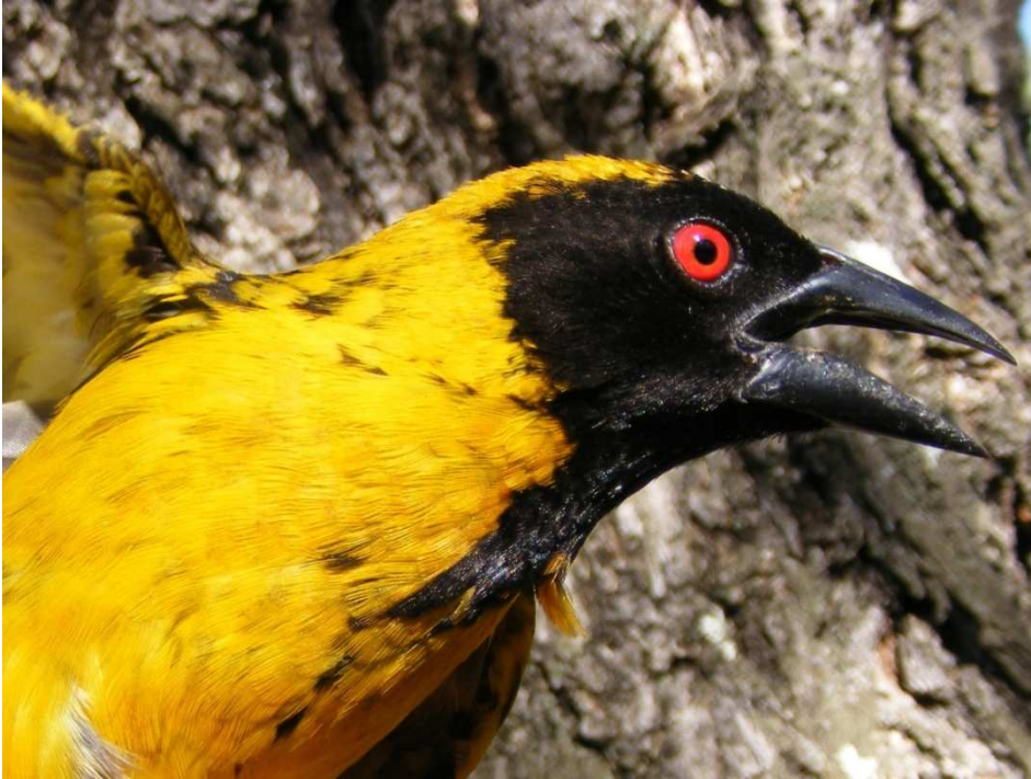
Fig. 2. Village Weaver (CV47182), Swebeswebe.