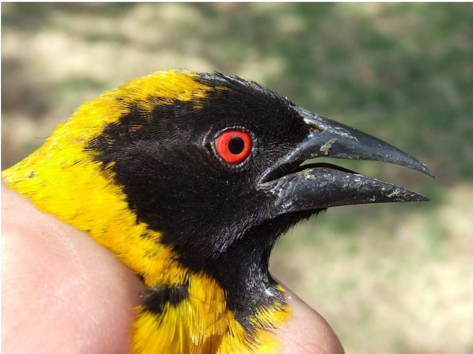
Fig. 3. Village Weaver (CV37922), Swebeswebe.